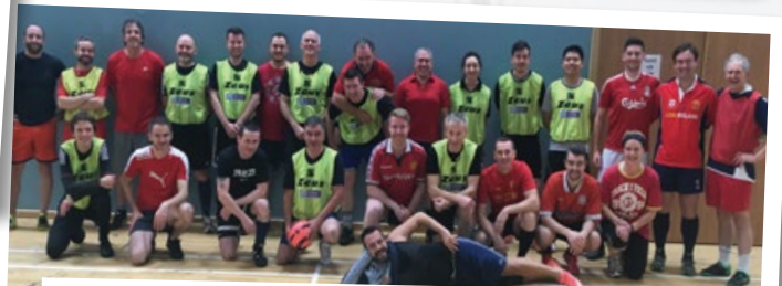
Still Fit at Forty! In October, staff celebrated 40 years of their Soccer team with a challenge match in the Kingfisher Club followed by a gathering of past and present players in the College Bar. 'Some great stories were shared, many embellished with the passing of time'.