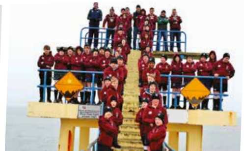
Tough bunch: Members of the NUI Galway Academy rugby club youth teams struck a pose in Salthill before departing on their annual rugby tour to Bristol.