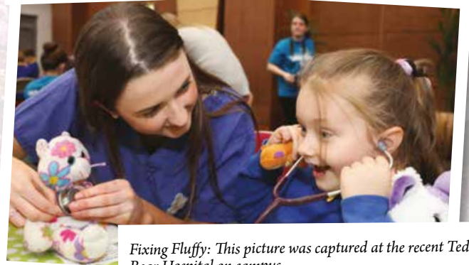
Fixing Fluffy: This picture was captured at the recent Teddy Bear Hospital on campus.