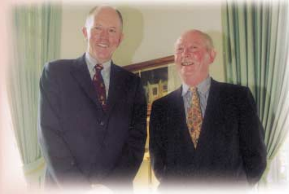
The President with John McGahern

Acclaimed author John McGahern presented his extensive archive of literary papers to NUI Galway in October. The collection consists of forty years of writings, including the manuscripts of The Dark , The Barracks , Amongst Women and his latest novel - That They May Face The Rising Sun . All future work by the author will be added to the archive which will also include John