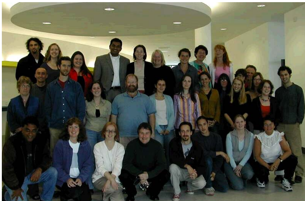
Participants in the 2002 summer course on minority rights