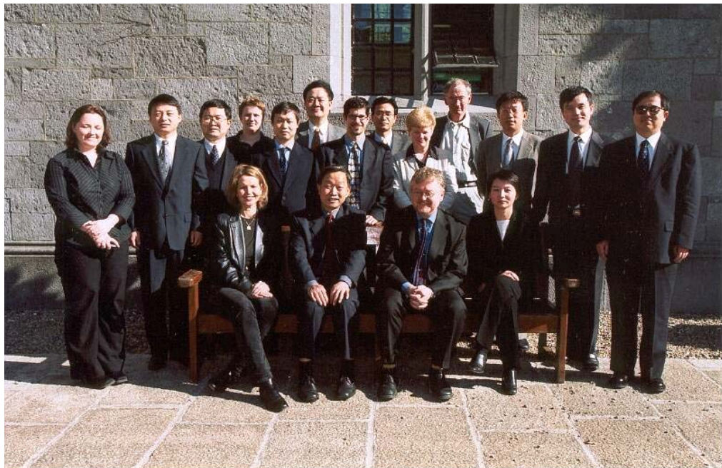
In April 2002, the Centre hosted an expert meeting of Chinese and European human rights scholars as part of its activities under the EU-China Network project.

An acute need has been felt for additional work areas to be made available to both PhD students and those registered in the LLM programme. Plans to reconfigure the documentation centre are underway. This work, which it is hoped will be completed by the end of 2002, will provide as many as twelve new carrels or work spaces for post-graduate students.