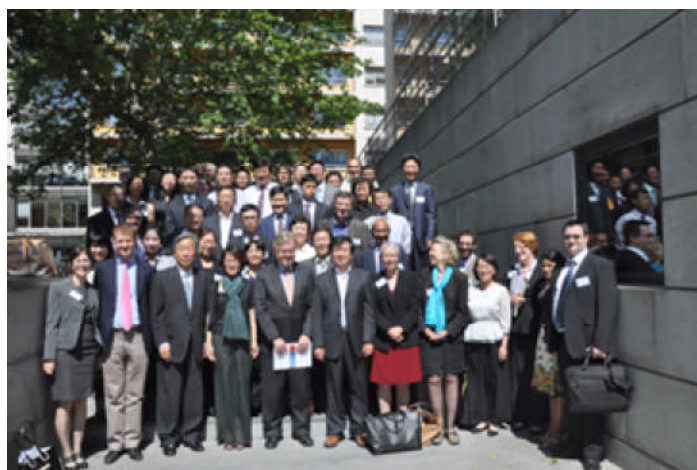
EU China Human Rights participants in Madrid

The three-year EU-China Human Rights Network project provides a grant of 1.5 million Euro to the Irish Centre for Human Rights to develop and lead an unrivalled network of human rights specialists from across the EU and China. The 30 European and 20 Chinese institutions involved in the Network collaborate with non-governmental organizations to analyse human rights practices through the EU-China Human Rights Seminar process and associated activities. The next EU-China Human Rights Seminar will take place in China in the last quarter of 2010.