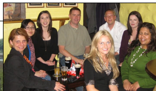
PhD candidates enjoying live music at the Crane Bar, Galway