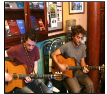
Gypsy Jazz duo performs background music

The evening reception included a Gypsy Jazz duo providing a lively atmosphere.