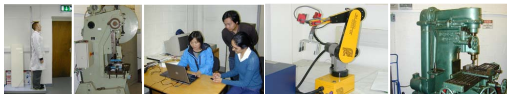
Injury assessment Punching press Team Work Robotic assembly arm Drilling and fabrication

Many of our courses now include 'project based learning' where you will work in teams to build special projects. Various projects require you to design and make special devices, design new processes for making devices and practice what you learn in lectures.