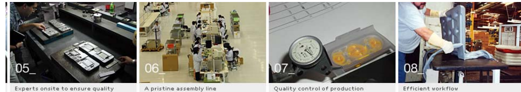
05 Experts onsite to ensure quality 06 A pristine assembly line 07 Quality control of production 08 Efficient workflow