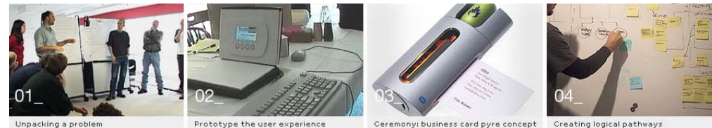
01 Unpacking a problem 02 Prototype the user experience 03 Ceremony: business card pyre concept 04 Creating logical pathways

Creative thinkers who can think outside the box to create new products; the processes that produce them; and the services that deliver them.