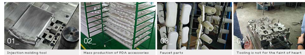
01 Injection molding tool 02 Mass production of PDA accessories 03 Faucet parts 04 Tooling is not for the faint of heart

Industrial Design Engineer | Innovation Manager | Engineering Manager | Operations Manager | Safety Engineers | Health Care Operations | Systems Analysts | Product Entrepreneur | Systems Manager | Quality Manager | Supply Chain Manager