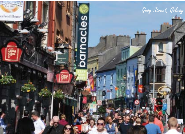
Quay Street, Galway