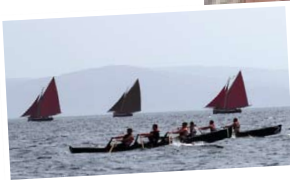
Curragh Racing on Galway Bay

Galway also serves as a great base for exploring other parts of Ireland and Europe. Dublin Airport is just 3 hours away and offers flights to popular European destinations including Rome, Prague and Amsterdam while Shannon Airport, just 1 hour from Galway, offers flights to popular European destinations including Paris and Edinburgh.