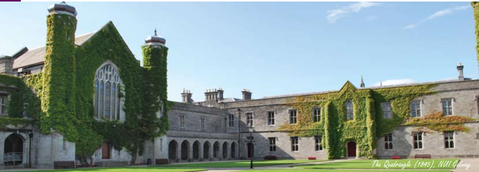
The Quadrangle (1845), NUI Galway