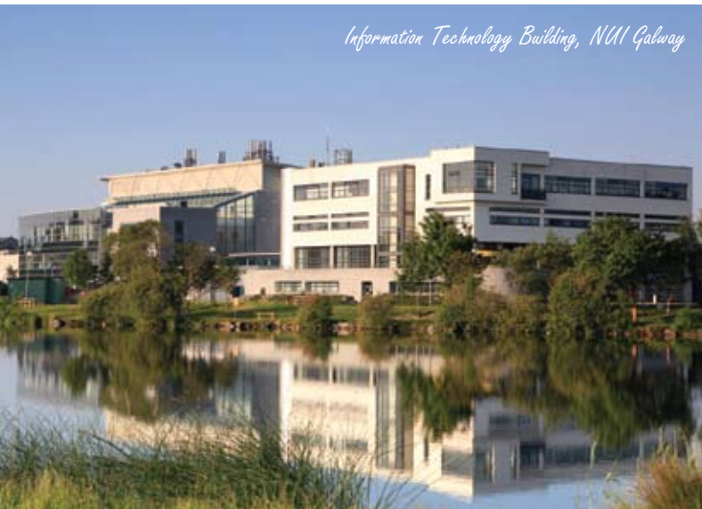
Information Technology Building, NUI Galway

I took a stroll.... the old Longwalk, Galway