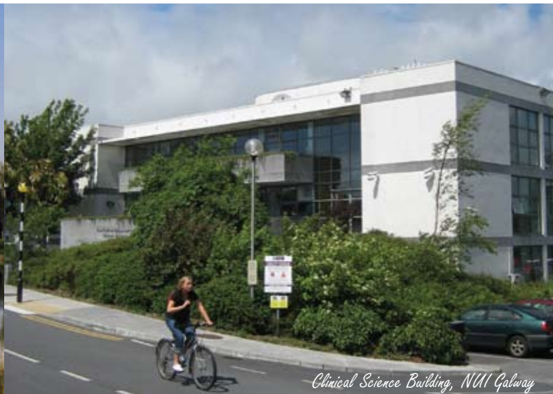
Clinical Science Building, NUI Galway