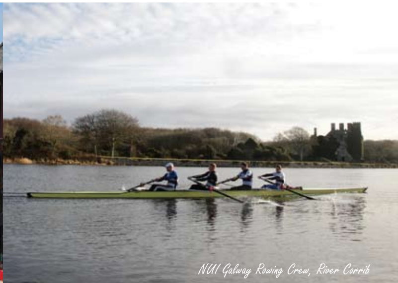
NUI Galway Rowing Crew, River Corrib