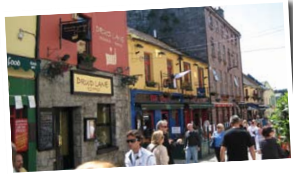
Galway - "Ireland's Cultural Heart"