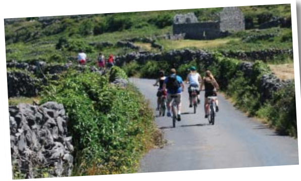
Exploring the beautiful Aran Islands