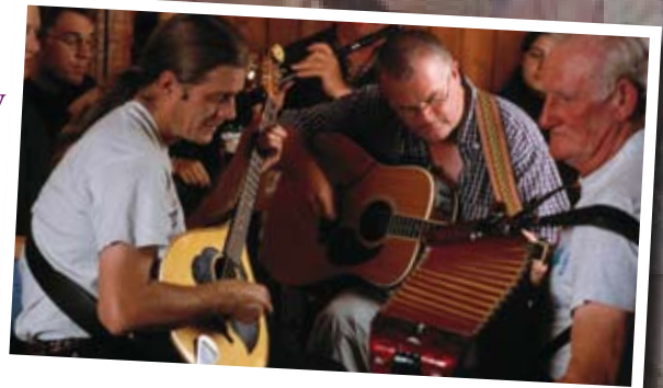
Traditional Music Session

Did you know? Ireland was named the 'World's Friendliest Country' by the travel publisher Lonely Planet in 2008 and 2010.