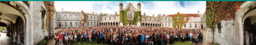
5.30pm Tuesday First Year Group Photo Shoot, The Quadrangle

Freshers' Fáilte Fun Fest – Welcome Tuesday programme - see page 8-9