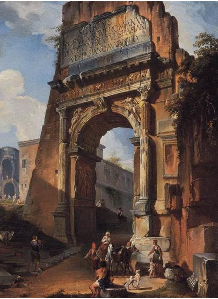
This draft: 4 September 2023

This document is available, with the Ancient Classics timetable, at the web address below. Please check there for any updates before semester begins.