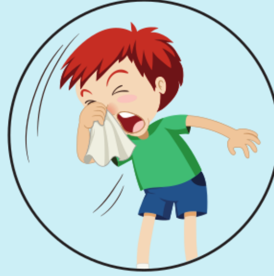
Harmful to our environment or cause us to cough or wheeze

Animals and plants are able to clean some types of pollutants, they are called biodegradable pollutants e.g. grass clippings, vegetables.