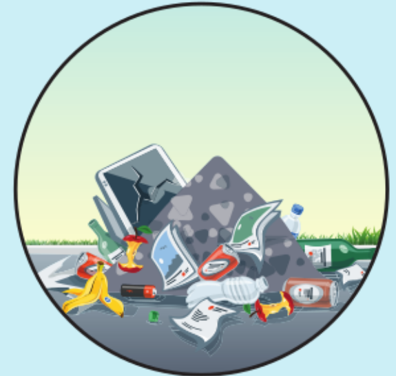
Litter on the street