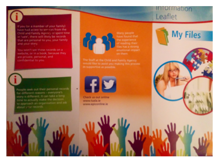
Figure 3.2: Sample Fora Product: Information Leaflet