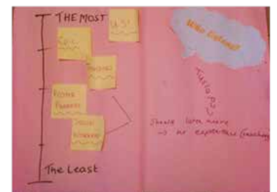
Figure 2.1: Sample Focus Group Research Documents