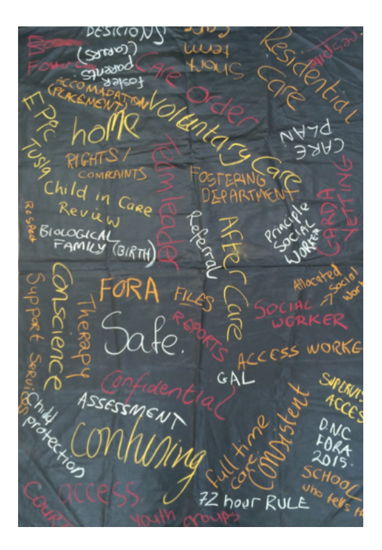
Figure 3.1: Sample Fora Work: Dictionary Preparation