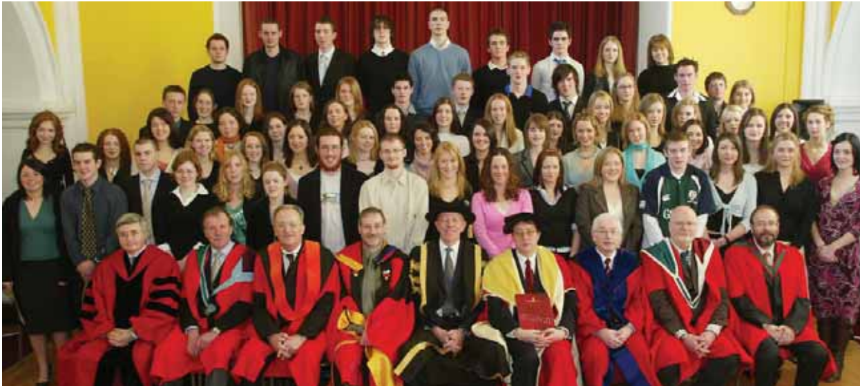
Entrance Scholarship winners with the President and members of academic staff.

Entrance scholarships have been awarded to 67 first-year students based on the results of the 2004 Leaving Certificate. The wide geographical spread of the winners is most notable. While 29 of them come from Co. Galway, the winners are drawn from 16 counties, from Carlow to Donegal and from Antrim to Cork. The scholars are students from 52 individual schools