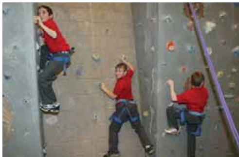
Pupils of St. Michael's Boys School, Mervue on the climbing wall in Áras na Mac Léinn.

Children as young as eight years old are currently the youngest students attending NUI Galway. They are participating in the Access Office's "Sport for Success" programme and enjoying every minute of it. Following one hour of concentrated homework, they rush to the sports hall for a game of soccer, uni-hockey, Thai-bo, or flex their muscles on the climbing wall. The programme is a combined sport and homework initiative aimed at 8-12 year olds and has been running successfully since 2001. "The aim of the programme is to break the cycle of educational disadvantage through