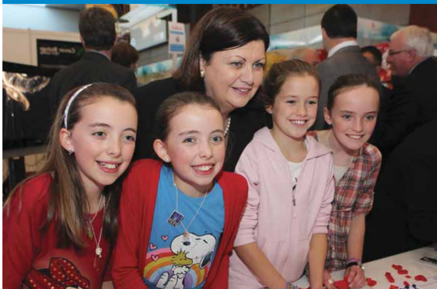
EU Commissioner Máire Geoghegan-Quinn meets some of the exhibitors at the Festival.

For the first time, NUI Galway hosted the Galway Science and Technology Festival Exhibition in November. The 13th Annual Exhibition saw more than 20,000 people pass through the Bailey Allen Hall. Máire Geoghegan-Quinn, EU Commissioner for Research, Innovation and Science, officially launched the Exhibition on the day and was very impressed with both the interactive exhibits on display and the numbers of visitors in attendance.