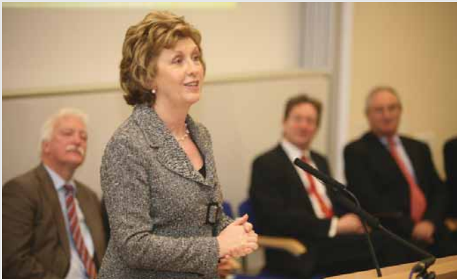
President of Ireland, Mary McAleese

President of Ireland, Mary McAleese has officially launched the UNESCO Chair for Children, Youth and Civic Engagement. The UNESCO Chair is the first awarded in the Republic of Ireland, and President McAleese described it as a “fitting endorsement by peers worldwide of the important work that is being done at NUI Galway to help solve the real problems experienced by young people and families in our communities”.