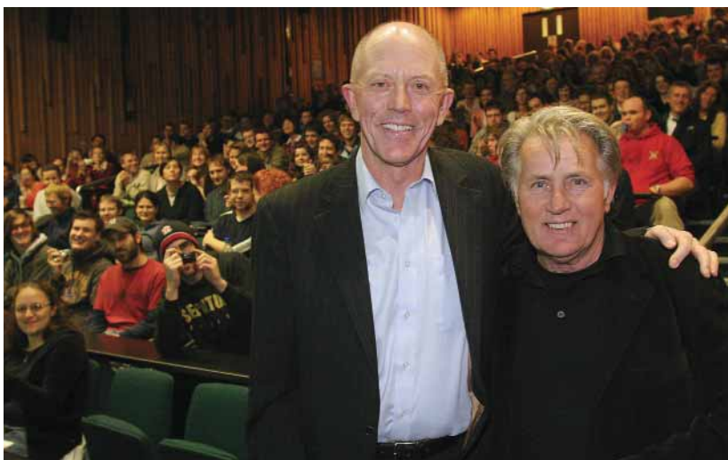
Presidents in the picture house!

Martin Sheen, NUI Galway's most famous mature student, treated 360 University staff and students to a sneak preview of the yet-to-be released movie 'Bobby'. The film, based on the last day of Bobby