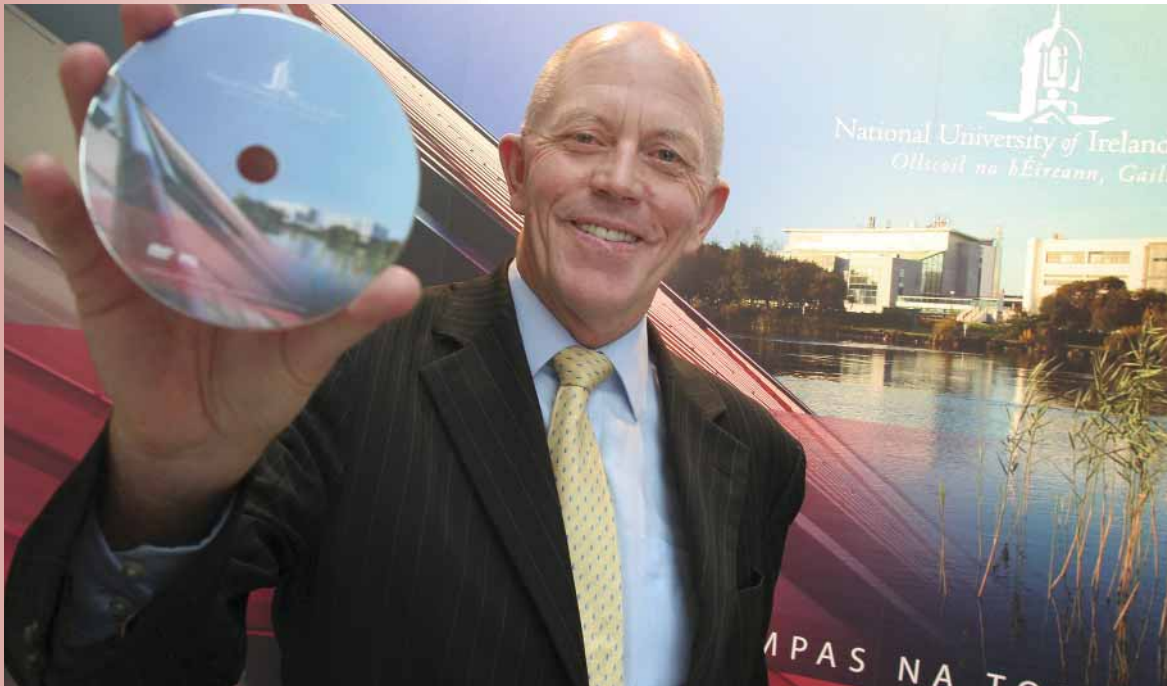
Pictured at the launch of the €400 million development project, President of NUI Galway, Dr Iognáid Ó Muircheartaigh.

The 'Campus of the Future' programme has been unveiled at NUI Galway, with details revealed of the major €400 million development project. The project will see approximately 20 large infrastructural projects undertaken, continuing the dramatic re-orientation of the campus to face the River Corrib.