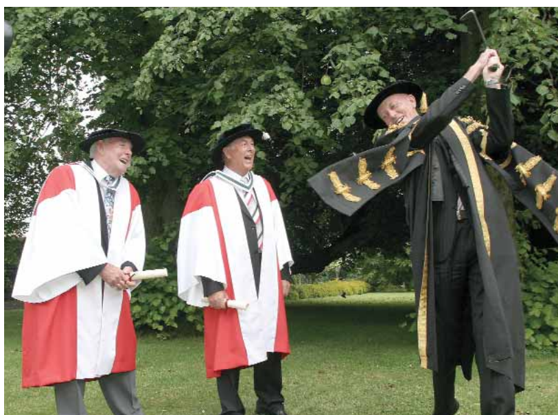
Christy O'Connor Sr and Jr give the President a golf lesson.