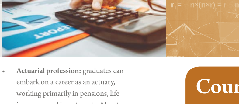
r = r_{1} + r_{\perp} r_{i} = n(n - r) Mg - nx(n - r) = r - n(n - r)

The BSc. in Financial Mathematics and Economics (BSc. in FME) programme is a four-year degree programme consisting of courses in Mathematics, Economics, Statistics/Probability, Applied Mathematics, Accounting and Business Finance and Computer Science. The aim of the programme is to equip students with expertise in quantitative subjects with a particular focus on financia economics, actuarial mathematics and statistics.