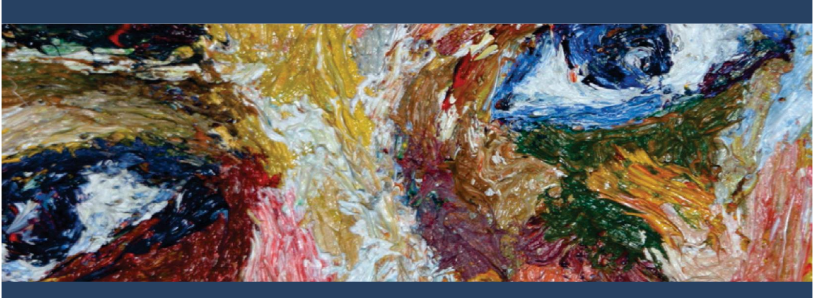
IRISH CENTRE FOR HUMAN RIGHTS Promoting human rights through teaching, research and advocacy

Irish Centre for Human Rights National University of Ireland, Galway www.nuigalway.ie/human_rights Email: humanrights@nuigalway.ie Phone: + 353 (0)91 493609